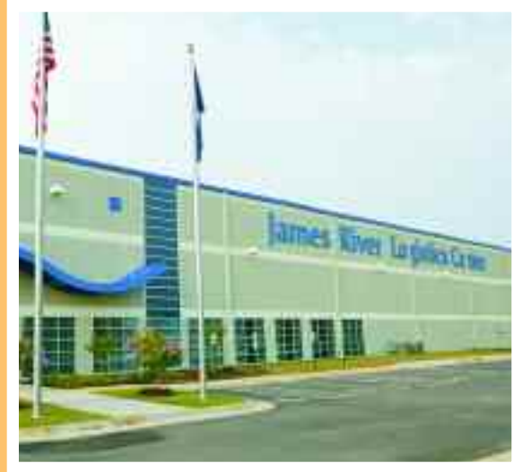
James River Logistics Center— Richmond, Virginia