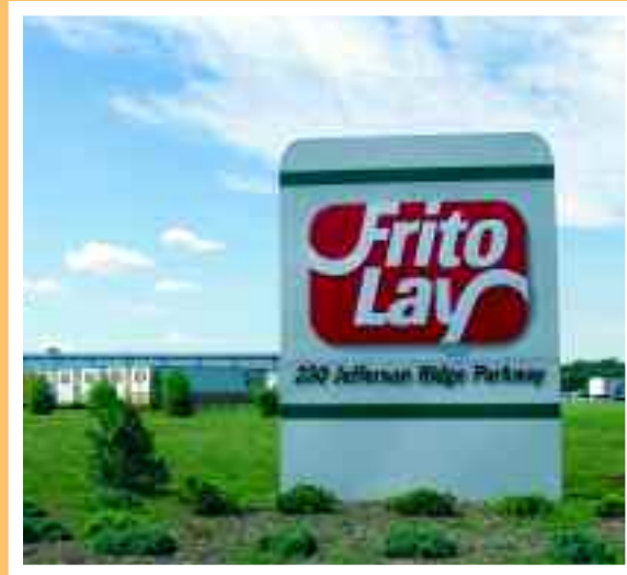
Frito-Lay— Lynchburg, Virginia

1512 Kyobo Building, 1, Jongro-1ga, Jongro-gu Seoul, 110-174 South Korea PHONE 82-2-739-6251 FAX 82-2-739-6538 E-MAIL vedpkor@virginia.or.kr